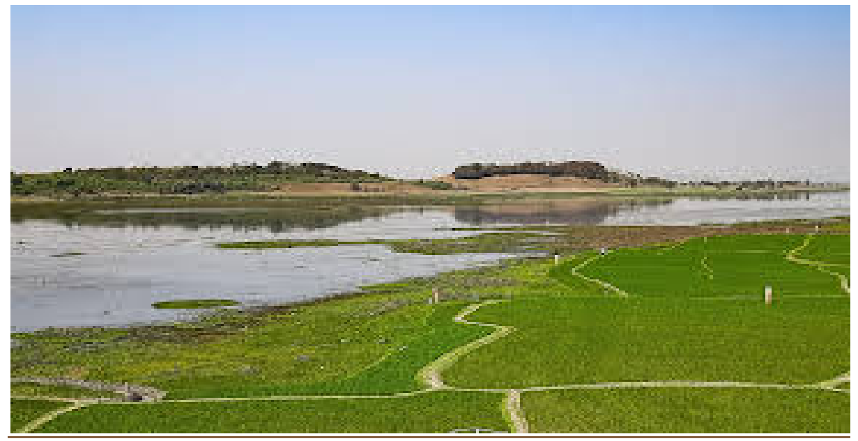
The site of the school is at a distance of only one and half kilometres from the famous tourist spotUdhwa Lake Bird Sanctuary, the only Bird Sanctuary in the entire state of Jharkhand.