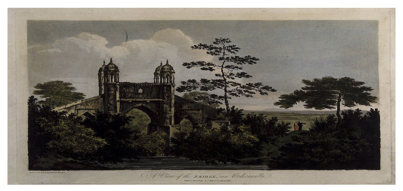
Bridge at Oodooanulla, drawn in 1781. A coloured etching by William Hodges

Flora Public School, Udhwa is situated at a very beautiful site at the foot of a hill famous as Dargah Pahar; a hill having shrine (Dargah/Mazar Sharif) of famous Sufi ...... on its top. Udhwa is also famous for a very historically important small river known as Uday Nala flowing for centuries from UdhwaPatoura Lake, a reservoir of water coming from 52 hills of Rajmahal ranges and it is connected to Ganga River through a 25 km long water channel known as the Udhuwa Nala, at Farraka.